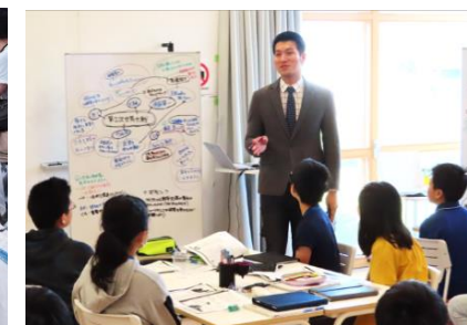
▲ Development of peace education curriculum for Hiroshima Global Academy (based on a collaboration agreement)