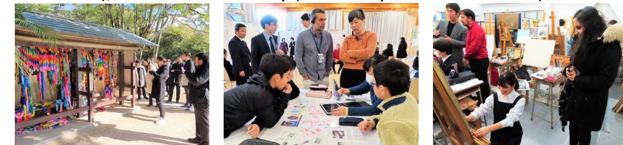
▲ Scenes from Peace Education & Lesson Study for Teacher Educator (PELSTE). Young researchers from Brazil, Canada, England, Singapore, the United States, and other countries participated to study Hiroshima's peace education and lesson studies in Hiroshima.