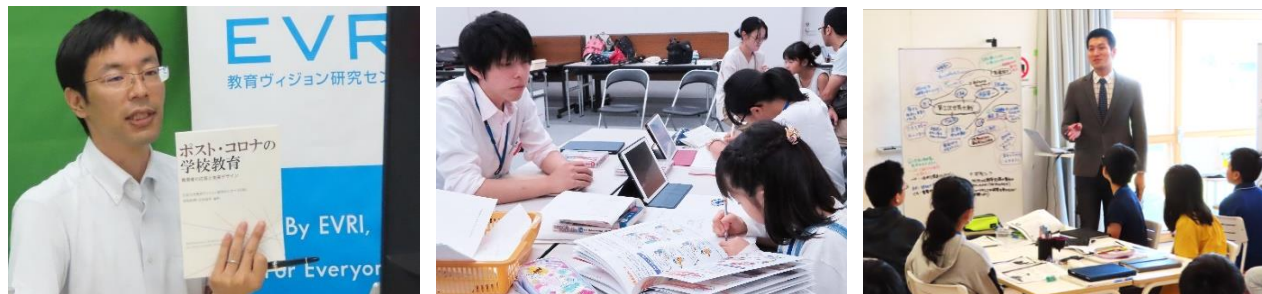
▲ Online seminars on post-pandemic education (Results published as a book)