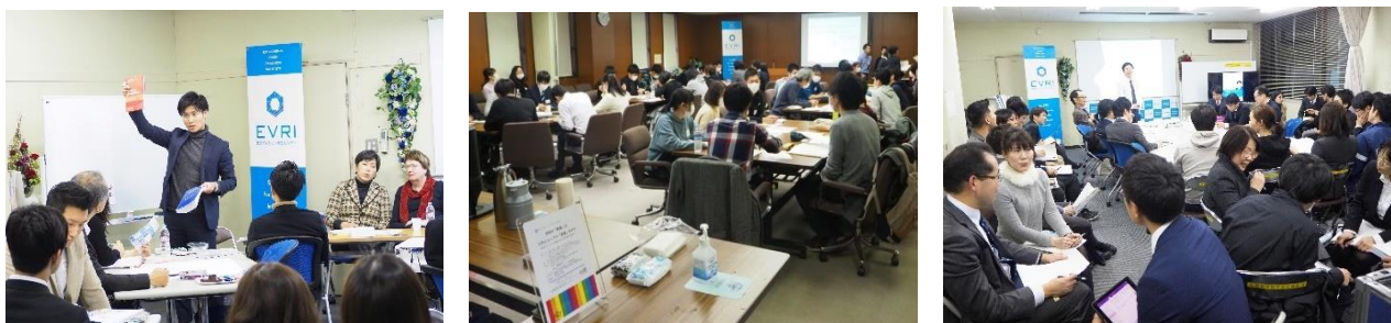
▲ Regular Seminars (including workshops) (Scenes from seminars on teacher educators, LGBTQ education, and teacher education)