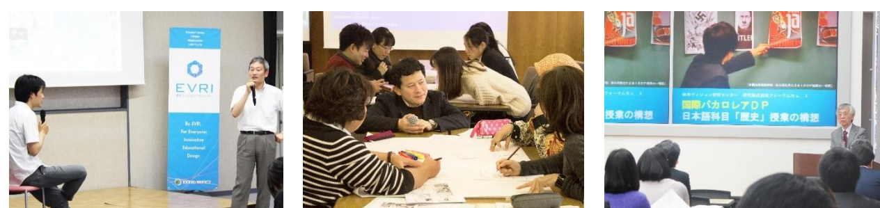
▲ Forum for Research Institute (Scenes from the forum on knowledge generation, inclusivity, and IB-edu.)

We discuss the latest research trends and policies of each unit in our “Regular Seminar,” and disseminate the research results of each unit and interact with leading researchers and practitioners in the “Forum for Research Institute.”