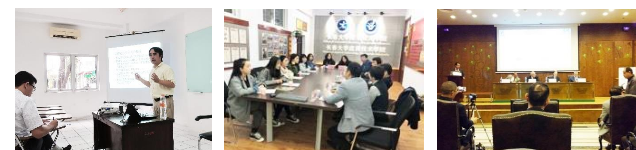
▲ Our researchers at Universitas Darma Persada in Indonesia (Japanese language and culture), Changchun University (early childhood education), and Cairo University (secondary school education)

HUGLI...Hiroshima University Global learning Institute INEI...International Network of Educational Institutes