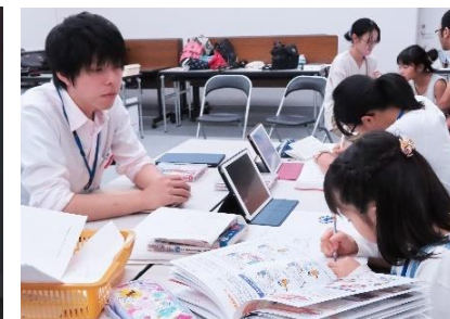
▲ Development of digital contents for local studies in Higashi- Hiroshima City (commissioned project)