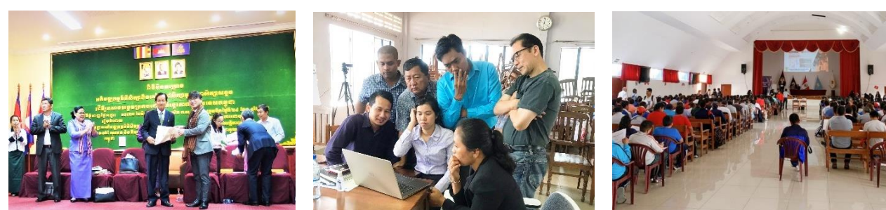
▲ Professional development for educators in Cambodia and Peru

In connection with each unit, we conduct social contribution projects including development of domestic and international curricula, textbooks, and teaching materials, training of professionals and teacher educators, and support for teachers' professional development and children's learning.