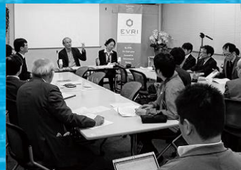
Lesson Study & Teacher Education in Germany at a Regular Seminar of EVRI

We design curriculum that support new learning for learners and teachers.