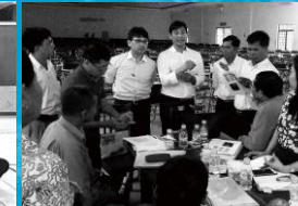
Support for Curriculum & Textbook Development at Ministry of Education, etc.