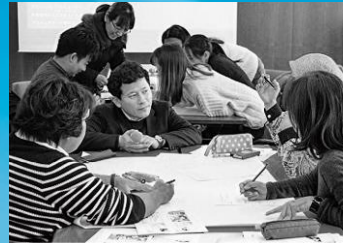
Workshop for "Inclusive Education in Regular Classrooms"

We design learning spaces and experiences where anyone can perform an in-depth learning at any time.