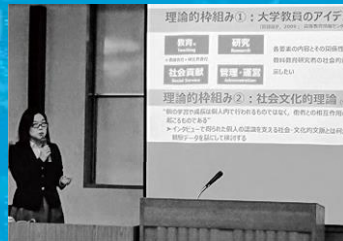
"COE-Creation Forum" on the Identities of Teacher Educators

We design the framework of professionalism essential for educators and researchers to support teachers.