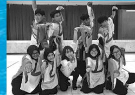
Lesson Improvement for Japanese Language & Culture Education at Darma Persada University