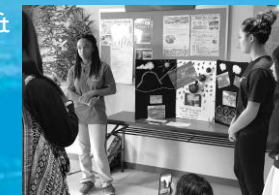
PBL Peace Education with High school Students from 5 countries