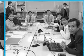
Professional Development for School Management at a Teacher Training College in Cambodia