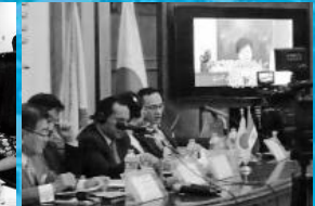
Lectures on Peace Education & Japanese Education System at Cairo University, etc.