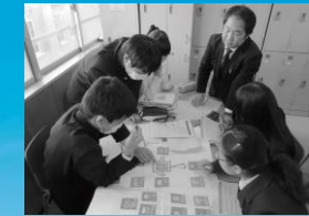
IB-model Lesson Study with Hiroshima Prefectural Board of Education